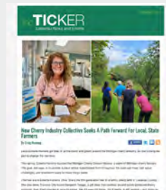
Leelanau Ticker Email & Website