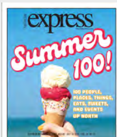
Northern Express Print & Digital