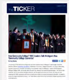
The Ticker Daily Email & Website